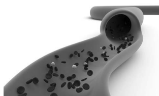
Normal blood flow